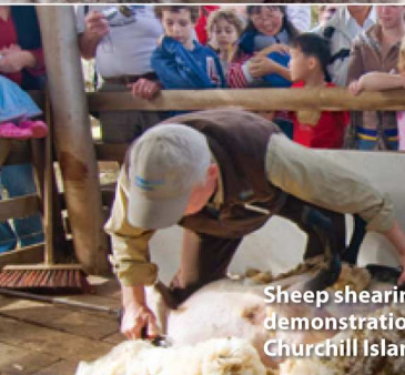
Sheep shearing demonstration at Churchill Island