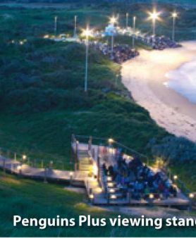
Penguins Plus viewing stand