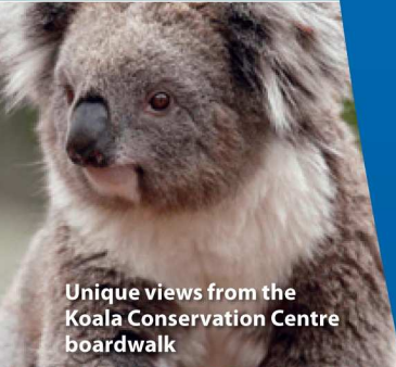
Unique views from the Koala Conservation Centre boardwalk